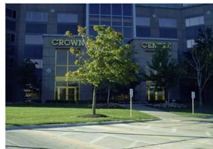
Crown Center Plaza on Rockside Road in Independence, Ohio.

With prayer as our first core value, the first event held was a PRAYER SUMMIT over a Friday and Saturday where 82 people passed through at some point in prayer. Various pastors from around the Cleveland area led one-hour prayer segments. PRAYER POCKETS were held recently throughout a few days and Rockside Church core group is sponsoring NIGHT-WATCH at the International House of Prayer in Cleveland from midnight to 6:00 a.m. on December 13. An e-mail prayer chain has been established to share prayer needs for the ministry.