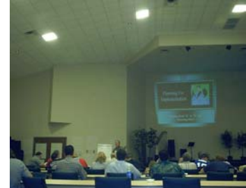
Church Planters' Boot Camp at Heartland Conference Retreat Center in August, 2002