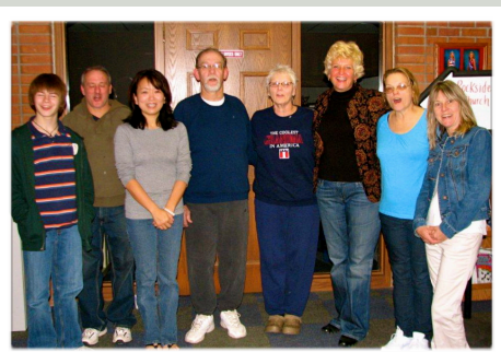
Group shot of the baptism candidates