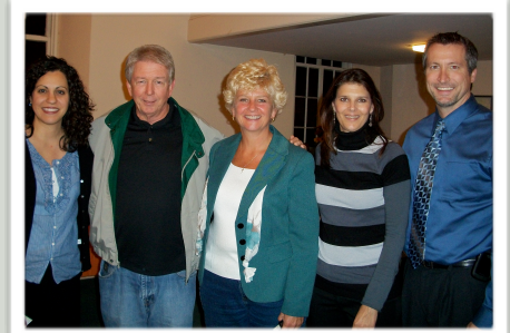
Working together with 25 & Alive and Youth for Christ to co-host the assembly program in Independence Schools