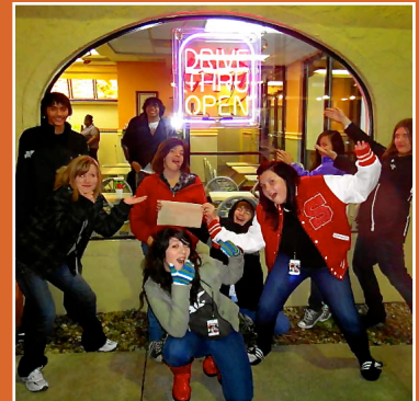
Students at Acquire the Fire convention