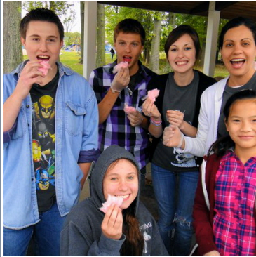
Fall Fest: Serving cotton candy and raising money for Acquire the Fire youth conference