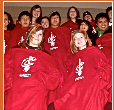
Making snuggie history at the YFC sponsored CAVS game