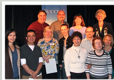
Welcome to the family, new members!