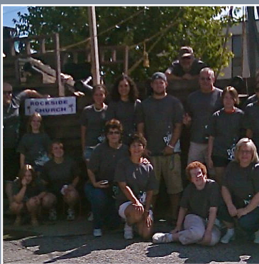
Home Days: Represented with 40 participants, Rockside won 2nd place for best float!