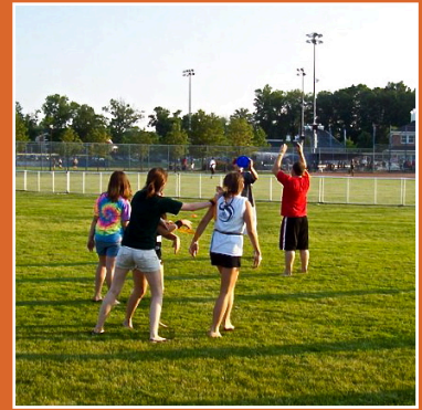
Playing ultimate frisbee at FUSION